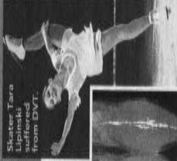
A magnetic scan shows a leg blockage (white line), indicating deep vein thrombosis. Its clots can be fatal.

There are tests to identify DVT, and simple solutions.